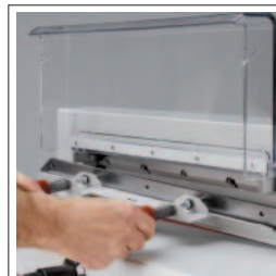
BLADE CHANGING DEVICE