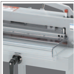
FRONT HAND GUARD