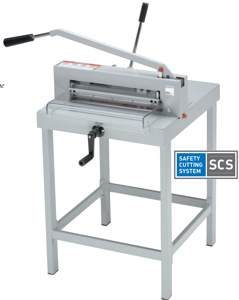
EBA 430 M with optional stand