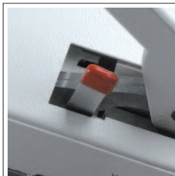
SAFETY CATCH FOR BLADE